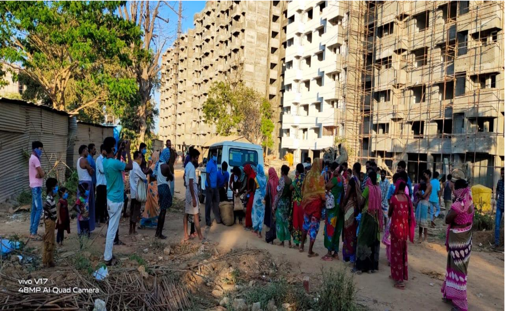
vivo V17 48MP AI Quad Camera