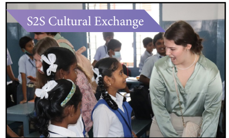
S2S Cultural Exchange