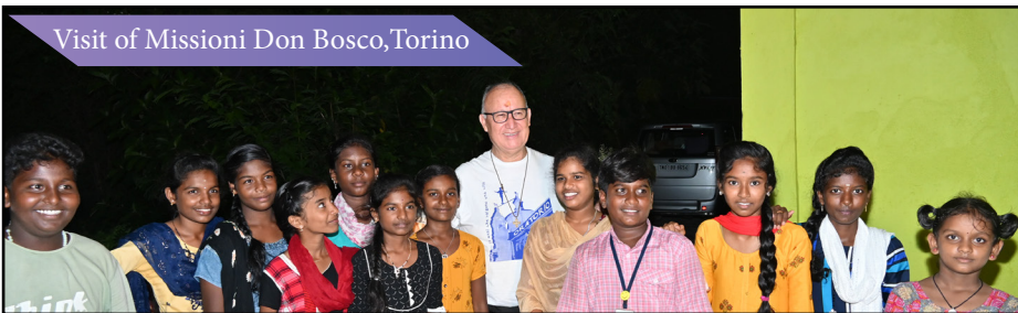
Visit of Missioni Don Bosco, Torino