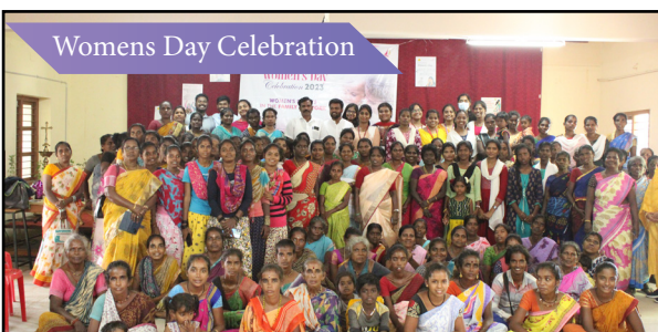
Womens Day Celebration