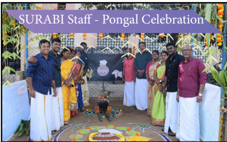
SURABI Staff - Pongal Celebration