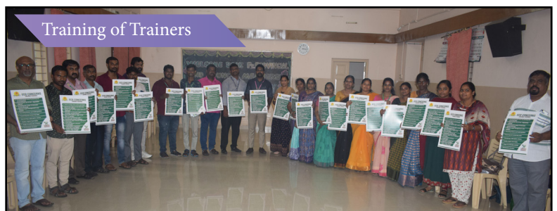
Training of Trainers